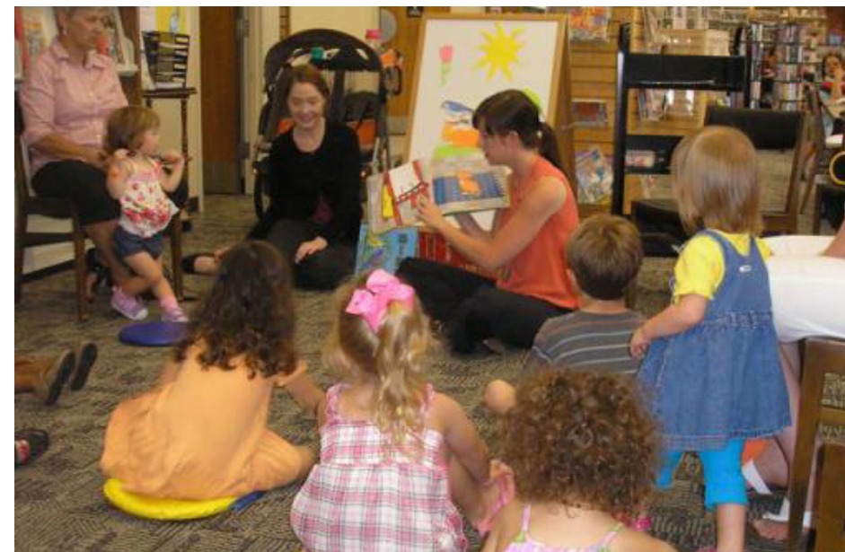
Wednesday Story Time attracts a fun crowd.

Check it out and sign up for membership or make a donation today!